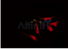
AF8101 staining SW626 by IF/ICC. The sample were fixed with PFA and permeabilized in 0.1% Triton X-100, then blocked in 10% serum for 45 minutes at 25°C. The primary Ab was diluted at 1/200 and incubated with the sample for 1 hour at 37°C. An Alexa Fluor 594 conjugated goat anti-rabbit IgG (H+L) Ab, diluted at 1/600, was used as the secondary Ab.

IMPORTANT: For western blot, incubate membrane with diluted Ab in 5% w/v milk, 1X TBS, 0.1% Tween@20 at 4°C with gentle shaking, overnight.